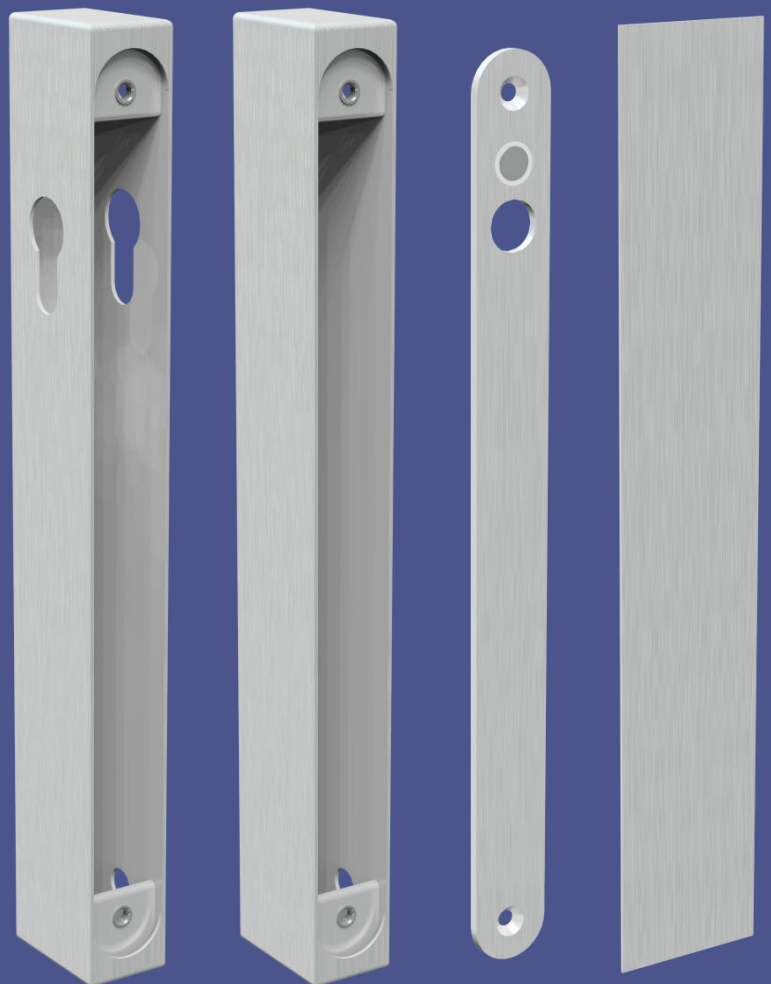
BOLT HOUSING (YNL144J)